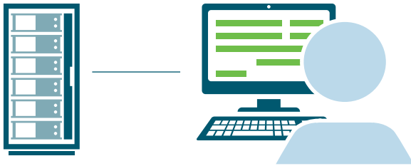
Agenda and minutes software